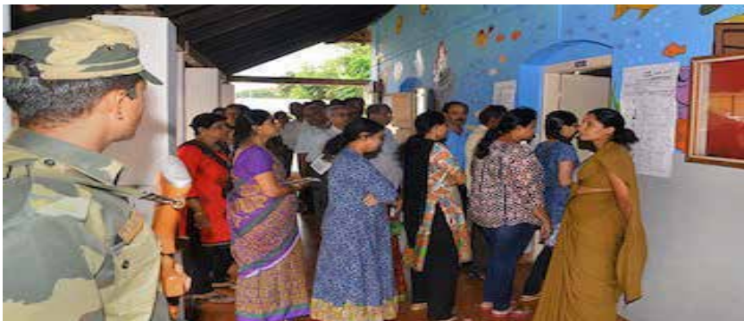
Polling Station arrangement