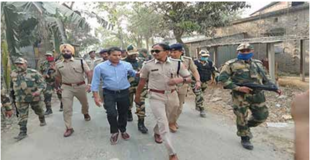
Area domination by Police and CAPF