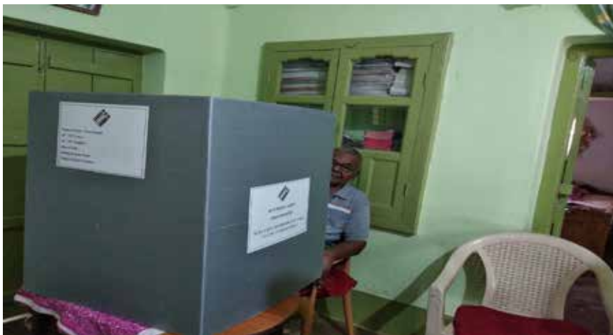
Casting of Absentee Postal Vote