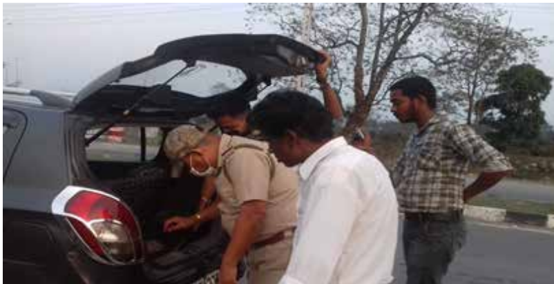
Checking of vehicles by FST