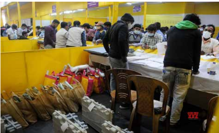
Distribution of materials at Dispersal Centre