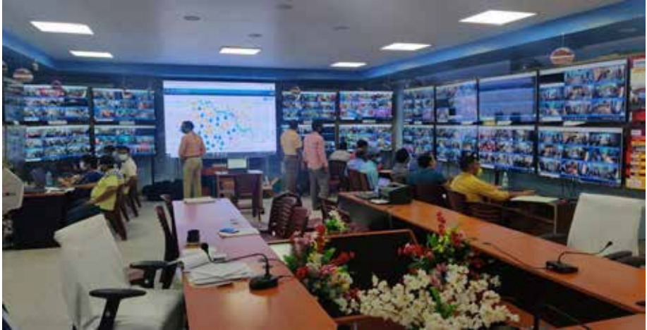
Media Monitoring Cell