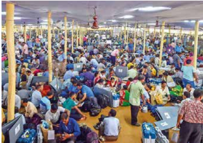
Checking of materials by polling parties at DC

at control rooms of Blocks / AROs on P-1-day afternoon for enabling ready availability on the Poll day.